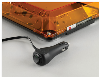
On/Off control switch on cigarette plug magnet mount models

The HighLighter LED mini-lightbar is available with Amber LEDs with a clear or amber dome. Suitable for a variety of applications—snowplows, landscaping, construction, repair and service vehicles, as well as law enforcement and fire apparatus.