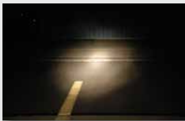
PAR-36 Halogen Lamp