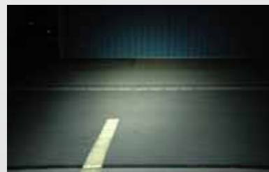
P36SLC Super-LED Lamp